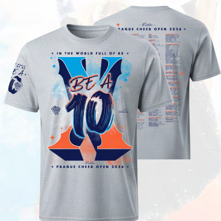
EVENT T-SHIRT 500 CZK