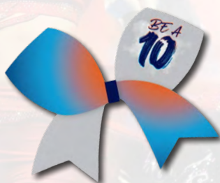
HAIR BOW (19 x 16 CM) | 500 CZK BOW KEYCHAIN (9.5 x 7 CM) | 300 CZK