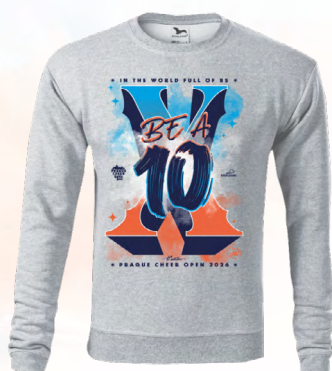
EVENT SWEATSHIRT 850 CZK