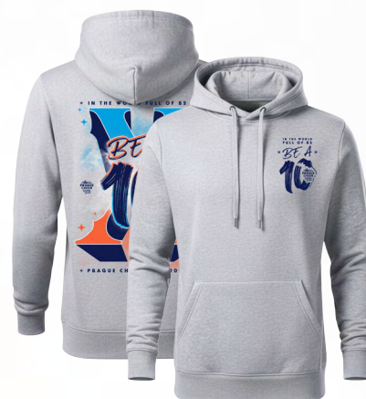
EVENT HOODIE 950 CZK